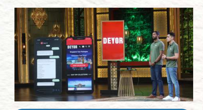
As Seen On Shark Tank India