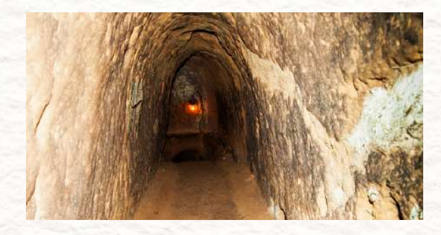
Cu Chi Tunnels