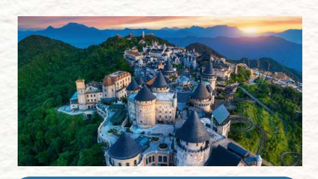
Ba Na Hills