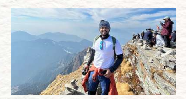
Trip Captain Included